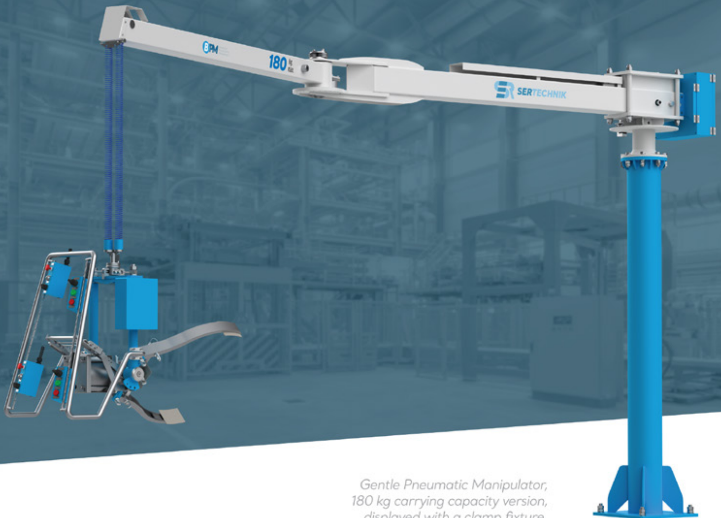
Gentle Pneumatic Manipulator, 180 kg carrying capacity version, displayed with a clamp fixture.

Gentle Pneumatic Manipulators are designed to move operator-centered loads within the work area with minimum effort. It balances the weight of the load, allowing the operator to carry the load quickly and safely.